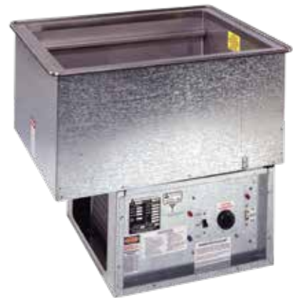
PANS & CASES