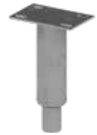
STAINLESS STEEL LEGS