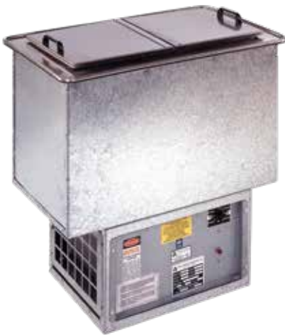
FROST TOPS & FREEZERS