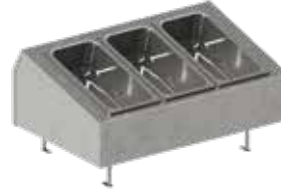
SILVER PAN DISPENSER