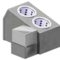
SILVERWARE AND NAPKIN HOLDERS